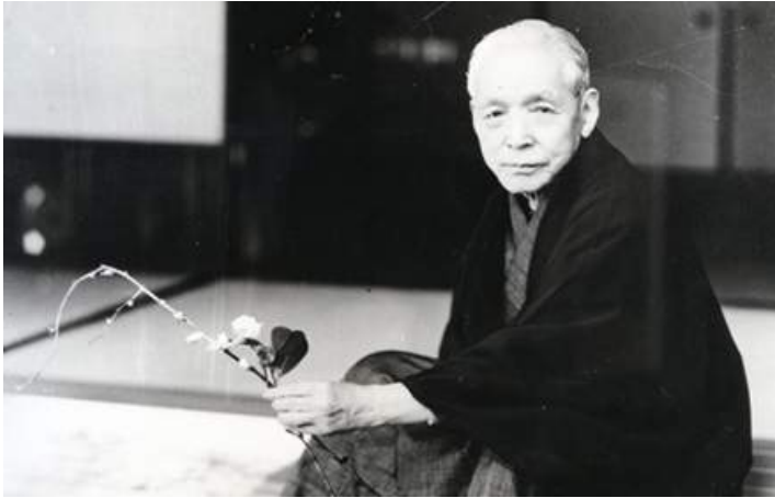
Ichizo Kobayashi, Father of the Takarazuka Revue

The Takarazuka Revue's motto of "modesty, fairness and grace" comes from the teachings of Ichizo Kobayashi. His goal was to offer "popular theatrical entertainments the whole family is sure to enjoy." Kobayashi's last words refer to the basics of performing arts—the singing, dancing and acting that create brilliant fantasies on the stage—as well as a desire for each Takarasienne to have etiquette and a good sense of proper manners, and to not forget their dignity as individual women and members of society. Even through the changes accompanying the passage of time, this spirit is a deeply ingrained part of every Takarasienne and staff member.