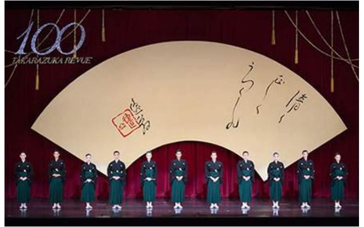
Takarazuka Revue 100th Anniversary Chorus (2014)