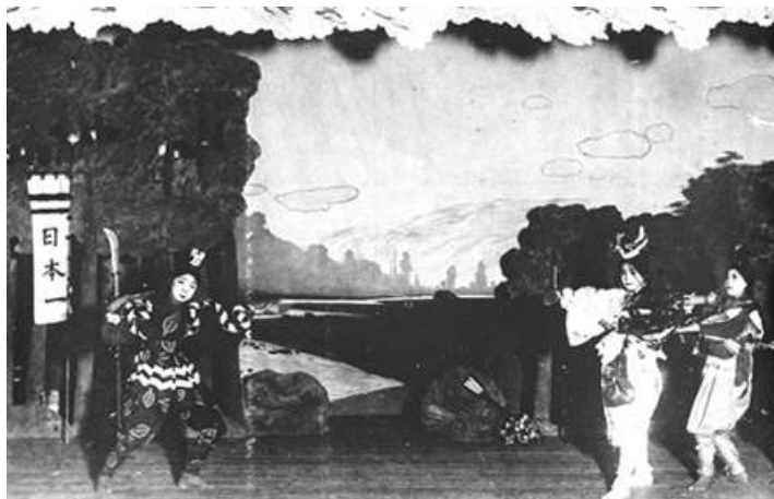
A stage photo from the opera "Dom-Brako"