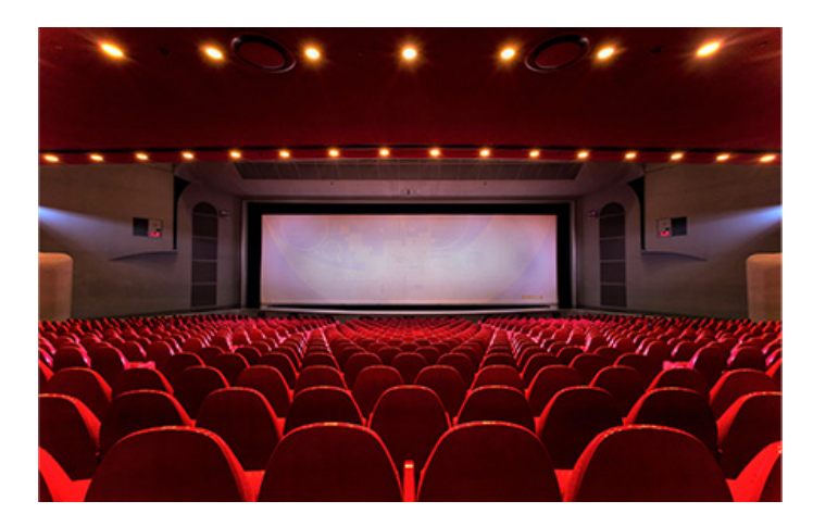
Tokyo Takarazuka Theater