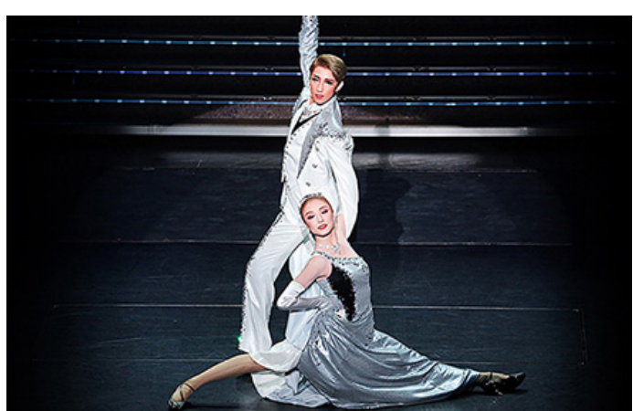
Cosmos Troupe, "NEVER SAY GOODBYE" (2022)