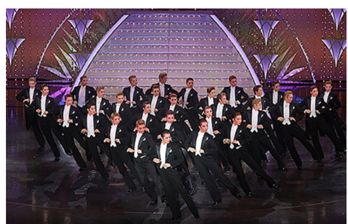
Star Troupe, "More Dandyism!" (2021)

The otokoyaku specialize in presenting as men on stage, while the musumeyaku help the masculine traits stand out more by emphasizing their own femininity. Removing either of these roles would result in Takarazuka losing its essence. Thus, the musumeyaku and otokoyaku working together is the greatest appeal of the revue.