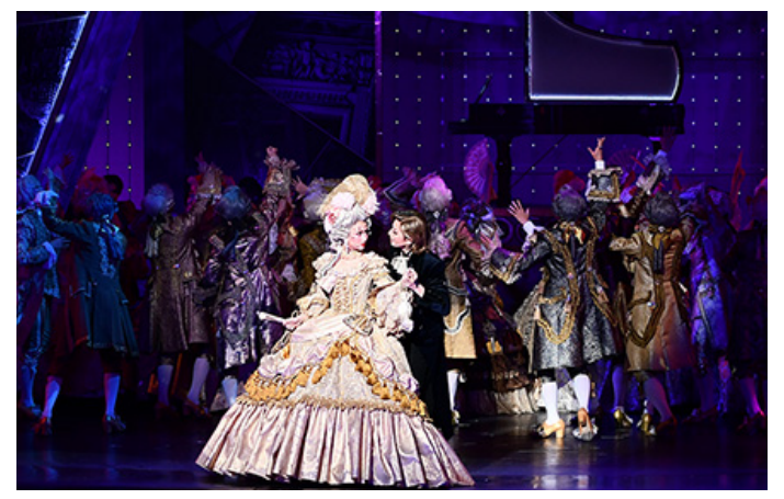
Flower Troupe, "Years of Pilgrimage: The Wandering Soul of Franz Liszt" (2022)

Of course, this well-equipped stage would be nothing without the marvelous costumes, props, and the actresses themselves. As the pinnacle of the Takarazuka Revue's aesthetics, they make the dream world come alive on stage.