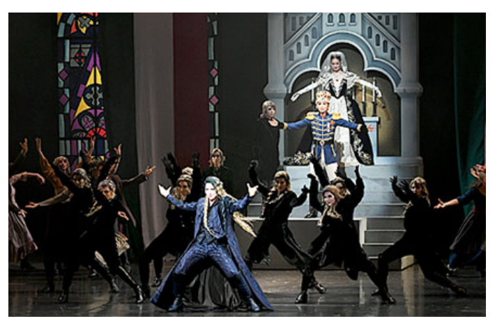
Moon Troupe, "Elisabeth - Rondo of Love and Death" (2018)