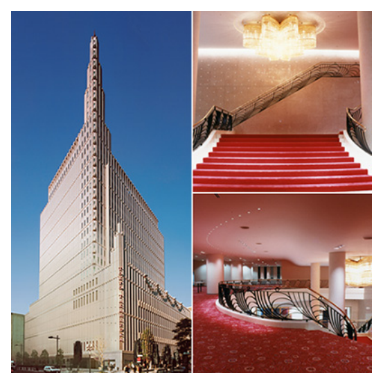
The Tokyo Takarazuka Theater

The Tokyo Takarazuka Theater, situated in the heart of the capital, is our second home. The stage setup is identical to the Takarazuka Grand Theater in Hyogo Prefecture. As it is conveniently located just five minutes on foot from Yūrakuchō Station, a large number of visitors pour into the theater on weekdays and holidays alike.