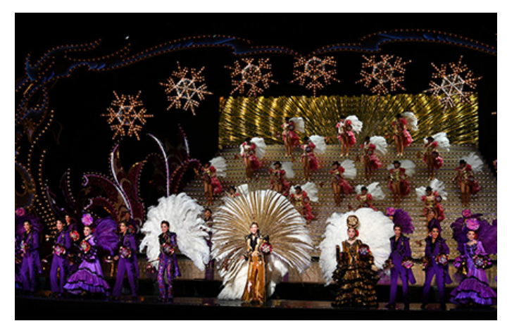
Snow Troupe, "Fire Fever!"(2021)