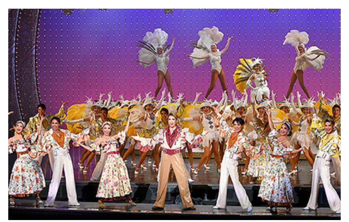
Cosmos Troupe, "Capricciosa!!"(2022)