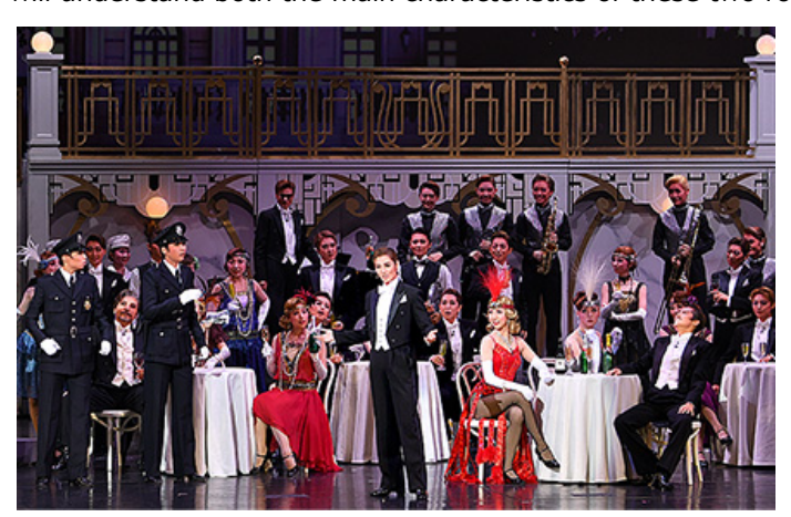
Moon Troupe, "THE GREAT GATSBY"(2022)

What has made the Takarazuka Revue attractive to audiences for the past hundred years? From the shows they put on, to the beautiful sets and specialized theater buildings, there are a lot of unique aspects to Takarazuka. But what really pulls audiences when it comes to Takarazuka is the dream world created by the all-female performers. The cool and stylish otokoyaku complement the feminine musumeyaku perfectly. Some believe that otokoyaku are "cooler" than real men in many aspects, and their existence is unique to Takarazuka. When you watch a show, we recommend comparing and contrasting the expressions and movements of otokoyaku and musumeyaku . Looking closely at them, you will understand both the main characteristics of these two roles and the individual charm of each actress as well.