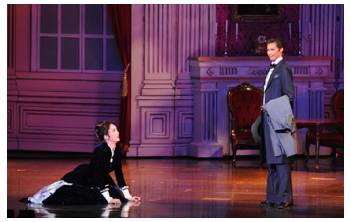
Cosmos Troupe, "GONE WITH THE WIND" (2013)

No matter how many times you watch a play, you can always find new details to marvel at.