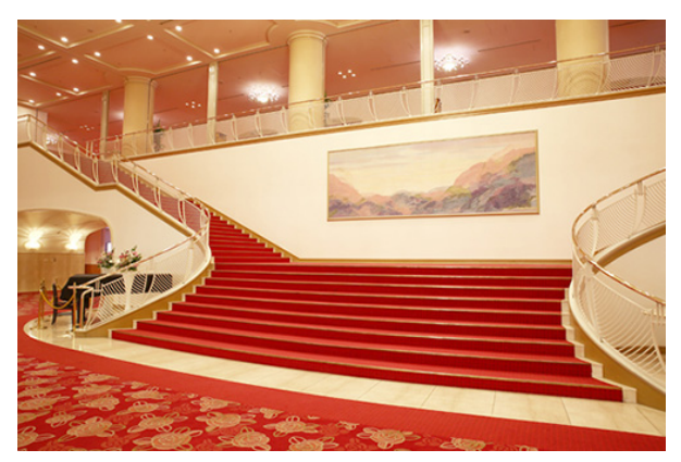
The Takarazuka Grand Theater's entrance

In the theater hall, a spacious stage awaits you, with audience seating arranged to provide an excellent vantage point, regardless where you are seated.