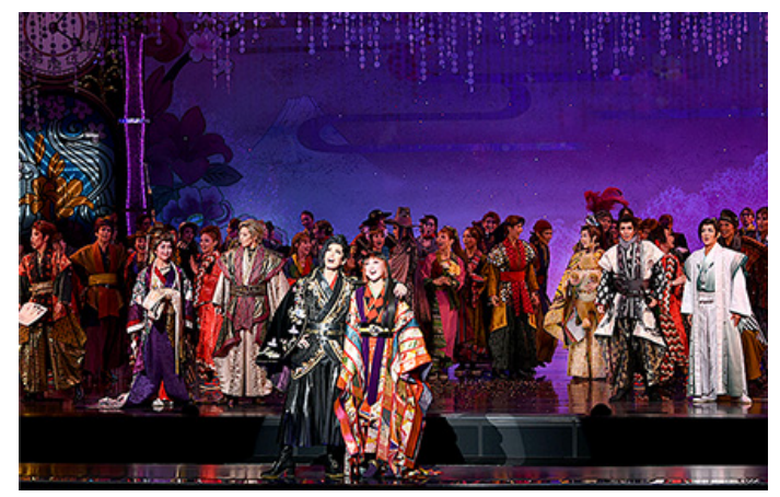
Flower Troupe, "Genroku Baroque Rock" (2021)