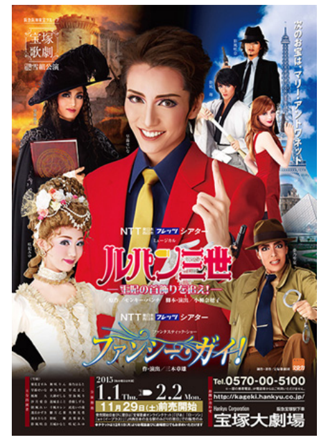
Snow Troupe, "Lupin the Third" (2015)